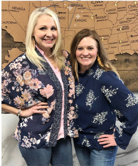
LEARN MORE ABOUT AMY