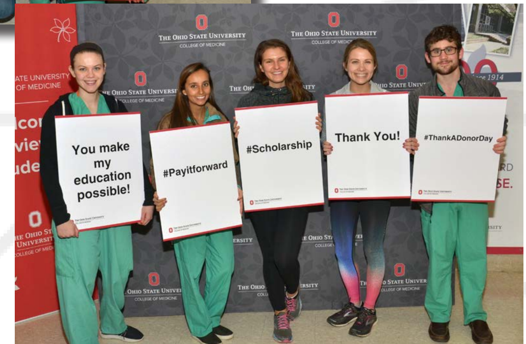
Photos: Scholarship recipients at the Ohio State College of Medicine celebrating Thank a Donor Day