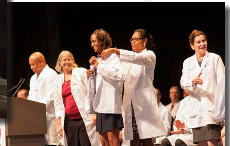
Photos: White Coat Day at The Ohio State University College of Medicine